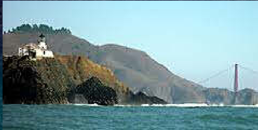
Pt. Bonita Lighthouse at the Golden Gate