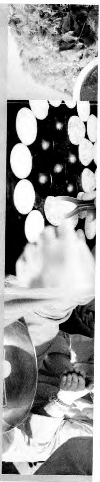
Alms Giving Ceremony (Tak Baat)

Every Saturday morning around 9 am in front of Thailand Plaza, hundreds of Thais would gather for an alms giving ceremony, which is called "Tak Baat" in Thai.