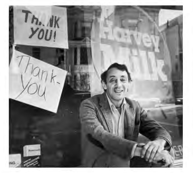
Harvey Milk San Francisco Board of Supervisors (1978)

What Supervisorial Districts Would Be Under Proposition T